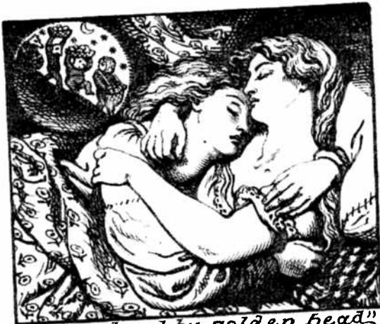
"Golden head by golden head"

Buy more;" and kissed her: "Have done with sorrow; I'll bring you plums to-morrow Fresh on their mother twigs, Cherries worth getting; You cannot think what figs My teeth have met in, What melons icy-cold Piled on a dish of gold Too huge for me to hold, What peaches with a velvet nap, Pellucid grapes without one seed: Olorous indeed must be the mead Whereon they grow, and pure the wave they drink With lilies at the brink, And sugar-sweet their sap."