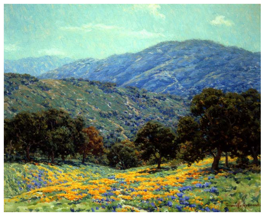
Granville Richard Seymour Redmond, Flowers Under the Oaks, Irvine Museum

loosely defined as Impressionism. Moreover, Impressionism came to America at least a decade after its riotous debut in France. As such, American painters benefited from the soothing effects of time on a critical art public. Also, they had the luxury of picking and choosing between a number of techniques and approaches, many of which were developed by artists who had progressed beyond Impressionism. These methods, principally Post-Impressionism, concerned themselves with specific uses of subject, color and line, and related to painting techniques followed by artists such as Paul Gauguin (1848-1903) and Vincent van Gogh (1853-1890).