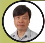
Zhihong Lin Gyrokinetic toroidal simulations