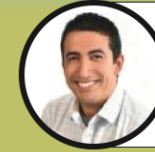
Franklin Dollar Ultrafast Laser Plasma Interactions