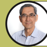
Toshi Tajima Laser Wakefield Acceleration